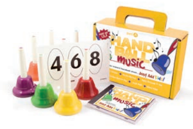
Visit MyHealthyChurch.com/Handbells to see all handbell sets.