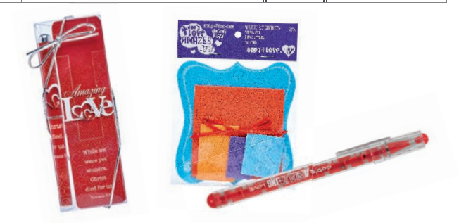
Visit MyHealthyChurch.com/ValentinesDay to see more.