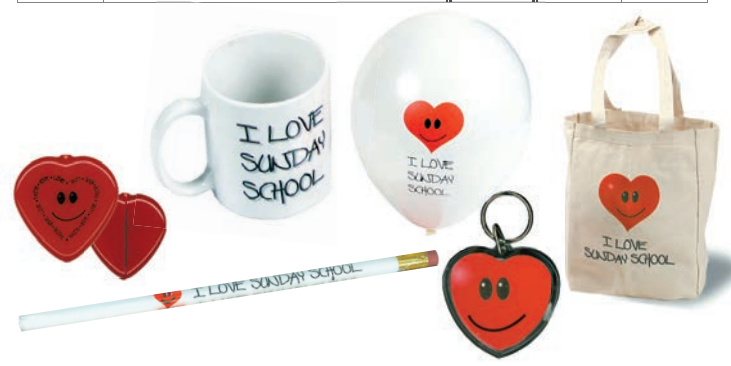
Visit MyHealthyChurch.com/ILoveSundaySchool to see more.