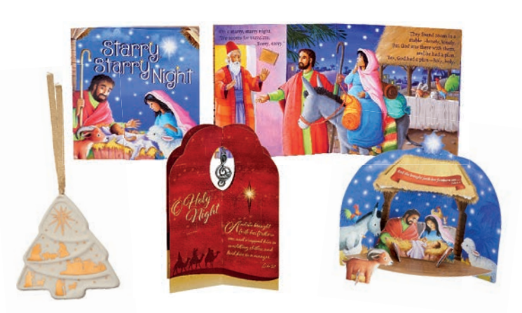
Visit MyHealthyChurch.com/Christmas for more Christmas resources.