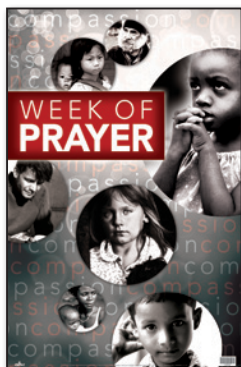
Week of Prayer Poster