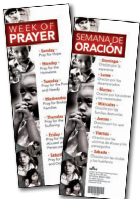
Week of Prayer Bookmark