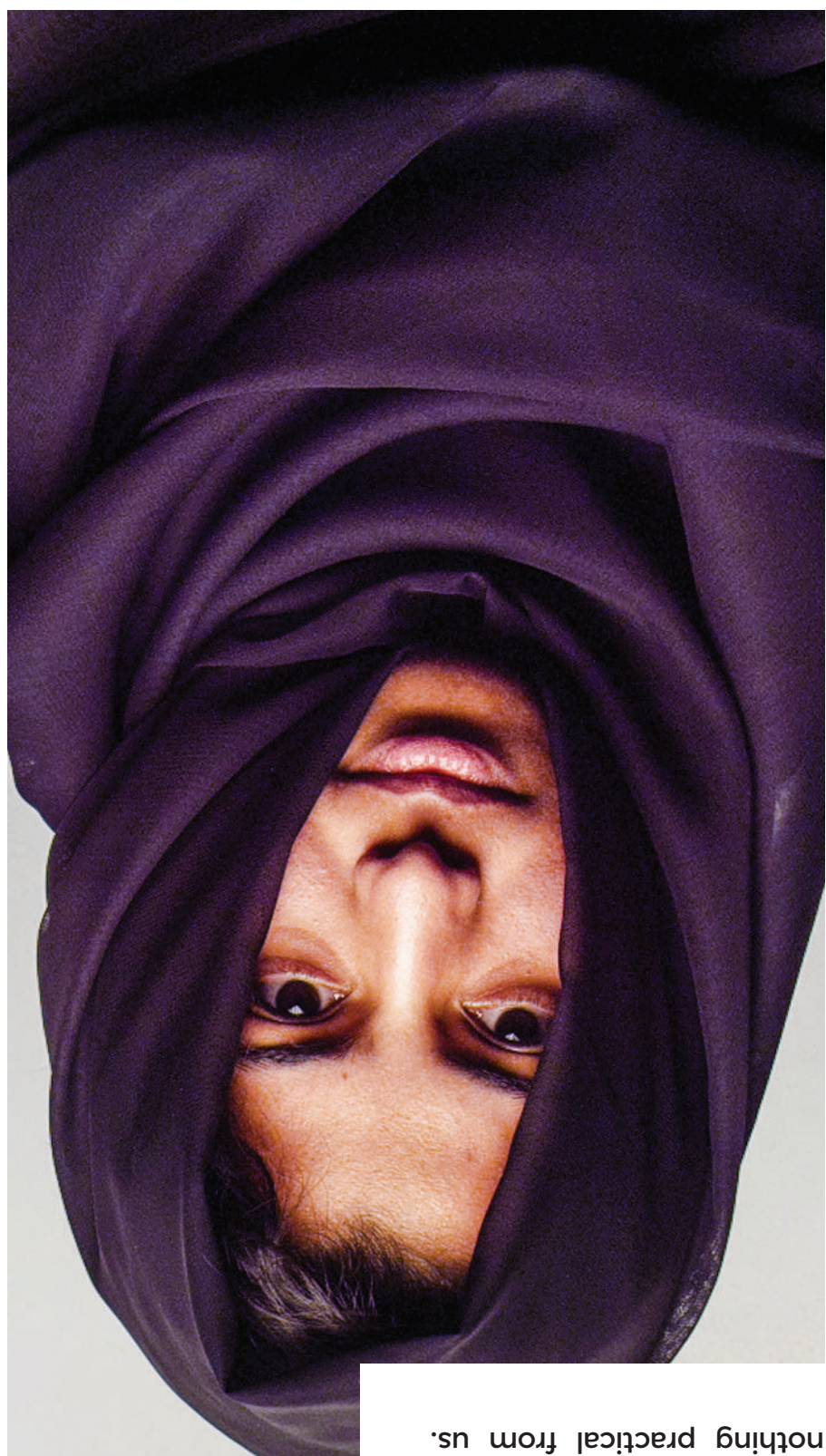
Excerpts from Live Dead The Journey

It sounds harsh but as long as the count is in my favor, I should be okay. Yes, I should be okay, and I will earn a place in paradise after I die.