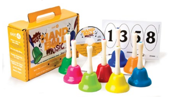
Visit MyHealthyChurch.com/Handbells to see the list of songs available in each set.